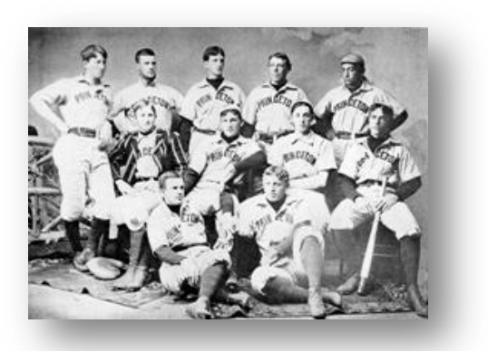
Princeton's Baseball Team, mid to late 1800's