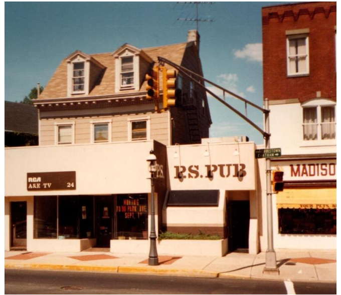
The P.S. Pub