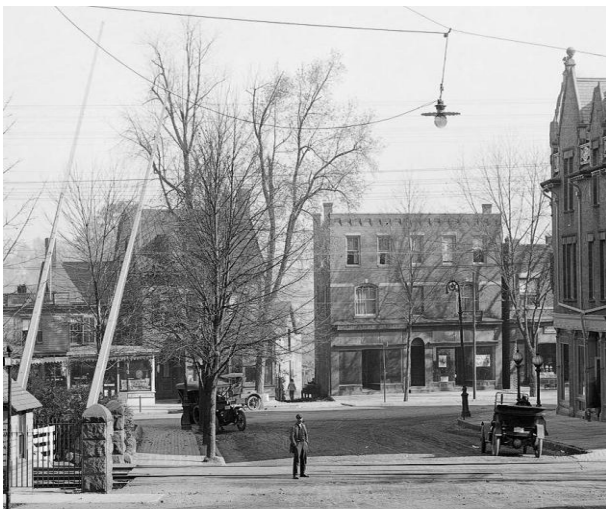
An early view of the site on Main Street where the Waverly Tavern, P.S. Pub, Four Seas and Shanghai Jazz were eventually located. Photo is pre-1915 when the railroad was elevated. Note the James Building on the right.