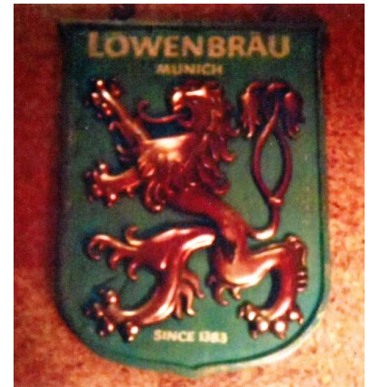
Lowenbrau beer sign from the Waverly Tavern