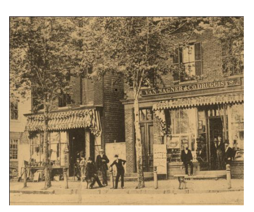
Southwest Corner, Waverly Place, 1880

Five historic photos of Madison are still available for purchase. The "Spires of Madison" shown on the right was so popular that it sold out and more needed to be ordered. Two sizes are available: 8"x10" are $30 and 11"x14" are $55. The photographs, printed by Park Lane Studios, will be available at the two spring programs as well as at the Society dinner in May.