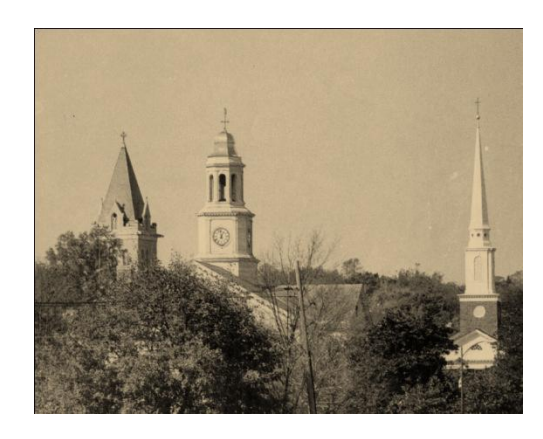
The Spires of Madison, 1969

Five historic photos of Madison are still available for purchase. The "Spires of Madison" shown on the right was so popular that it sold out and more needed to be ordered. Two sizes are available: 8"x10" are $30 and 11"x14" are $55. The photographs, printed by Park Lane Studios, will be available at the two spring programs as well as at the Society dinner in May.