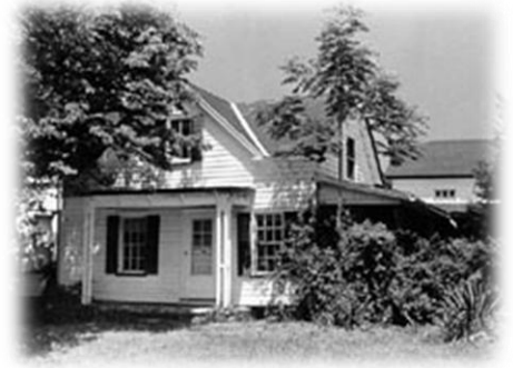
The Grimes House in Boonton