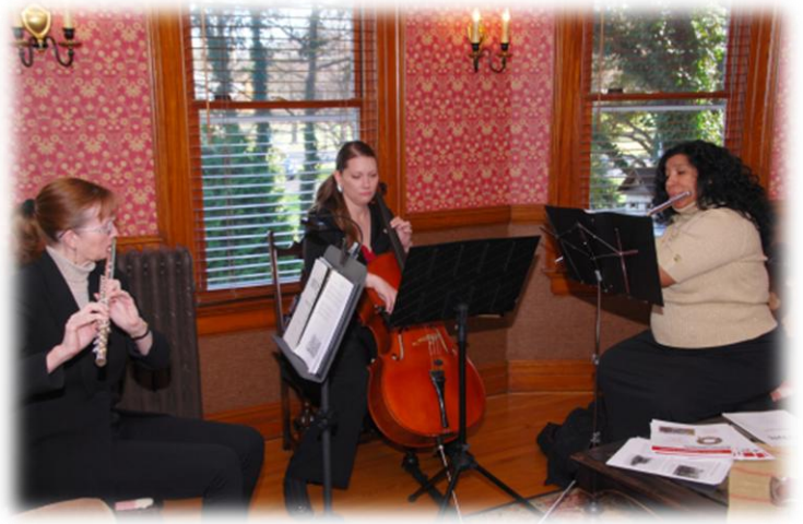
The Baroque Orchestra of New Jersey