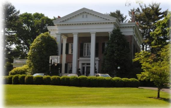
The Boisaubin Manor, Madison