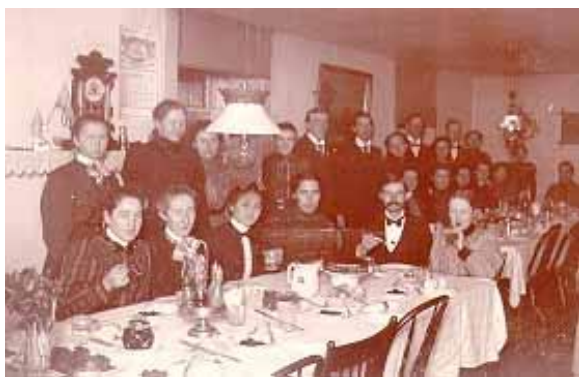
Typical boarding house meal. Location unknown.