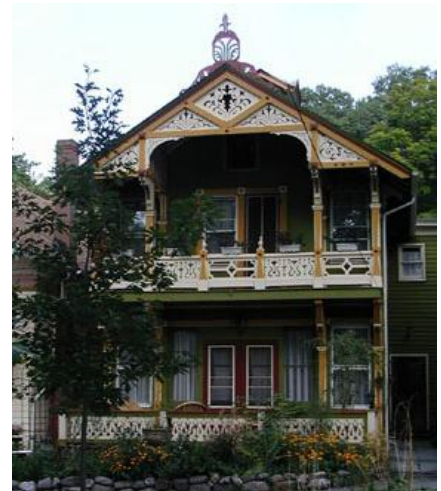
One of the Old Mount Tabor Houses

Sunday, September 26: Walking Tour Through Princeton. 2-4 pm. Enjoy a 1.9 mile, two-hour walk around downtown Princeton and the University campus as you learn about historic sites in the area, including Bainbridge House, Nassau Hall, the University Chapel and Palmer Square. Purchase tickets at Bainbridge House, 158 Nassau Street. $7 per adult, $4 children 6 to 12. Children 5 and under free. No reservations required.