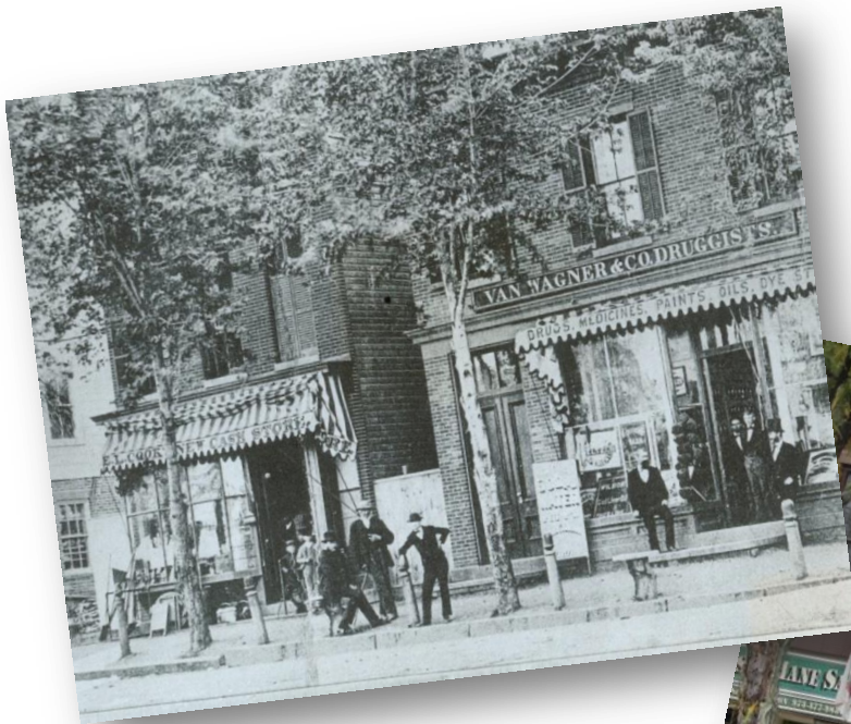
Waverly Place 1880s

For more 'Then and Now' photographs see pages 3, 4, and 5