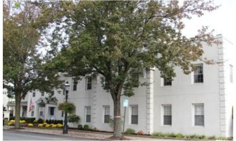
Burroughs, Kohr & Dangler Funeral Home 2017