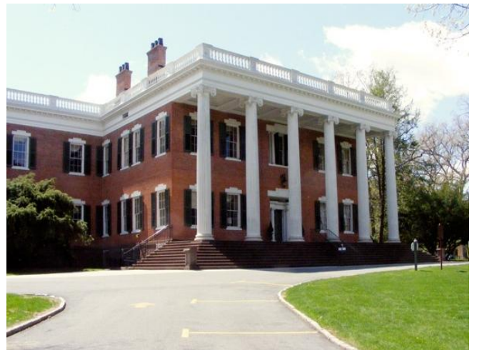
Mead Hall 2017