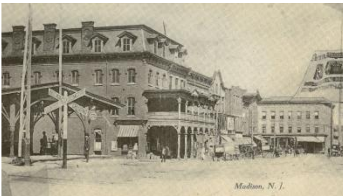
Waverly Place, Date unknown but prior to approval of the elevation of the railroad in 1914.