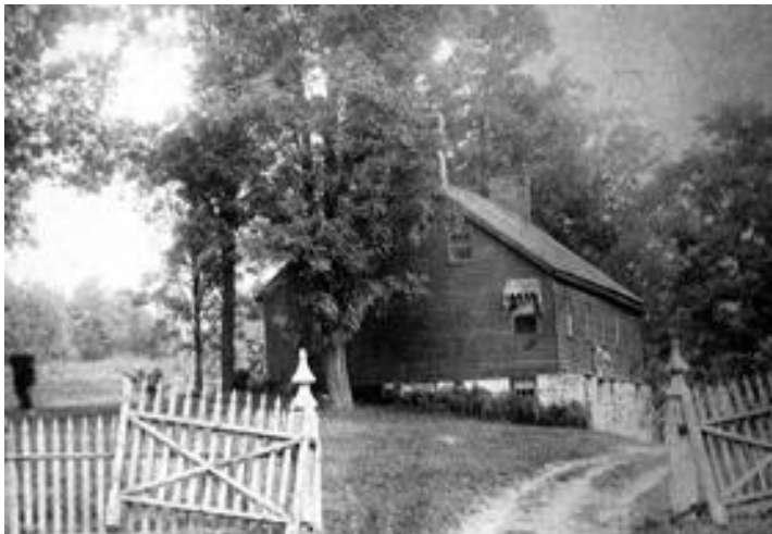
Luke Miller House, Ridgedale Avenue Date Unknown