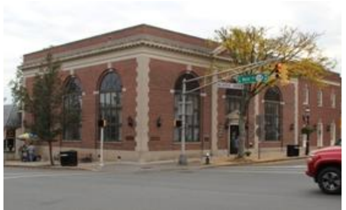
Chase Bank 2017. Same corner of Main and Waverly.