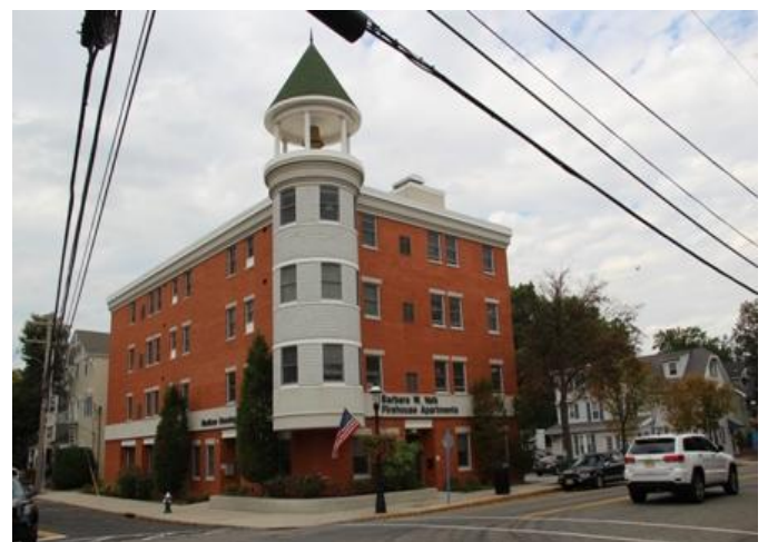
The Barbara W. Valk Fire House Apartments. New building in same location and similar style.