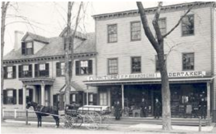
Burroughs Furniture and Undertaker Date Unknown