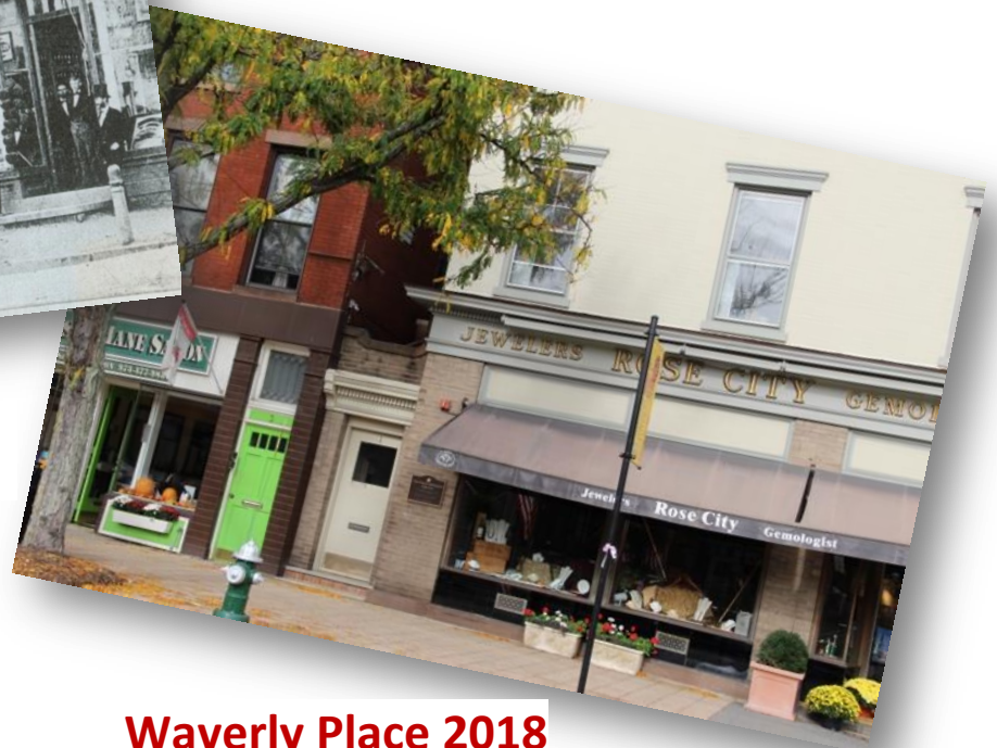
Waverly Place 2018