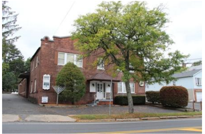
Rebuilt with brick in 1908. Photo 2017