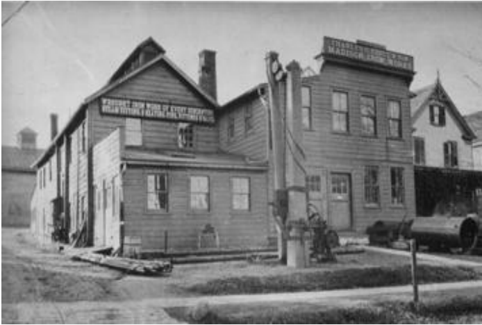
Madison Iron Works Park Avenue. Prior to fire in 1908