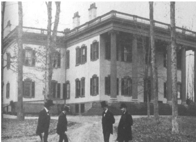
Mead Hall, Drew University, 1880s