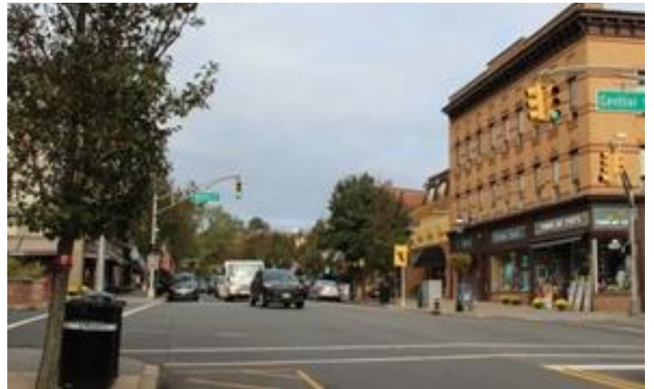
Main Street 2017