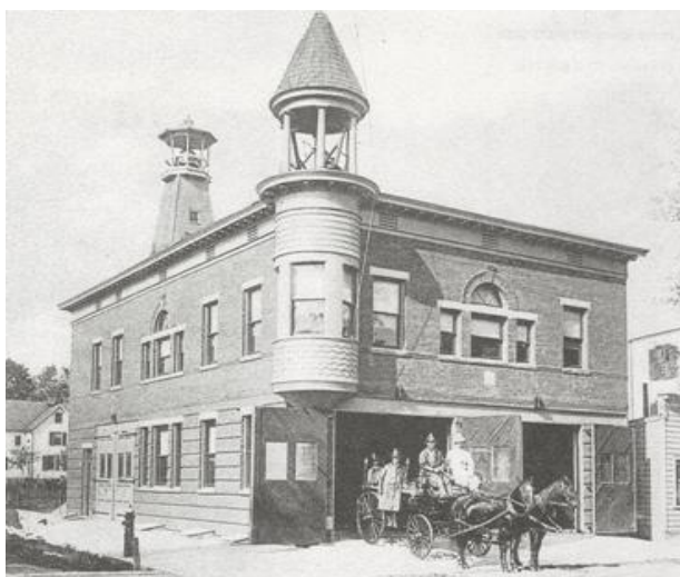
The old firehouse. 1880s. Corner of Central and Cook.