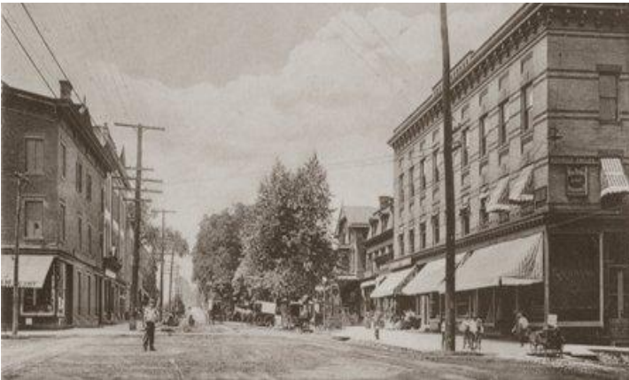
Main Street 1920

The photo gallery presented on the following three pages constitutes our version of “Back to the Future.” What is remarkable about some of these pairings of photographs is not how much things have changed over more than a hundred years. That is to be expected. What is so interesting is that in some cases how much has stayed the same. We hope you enjoy them.