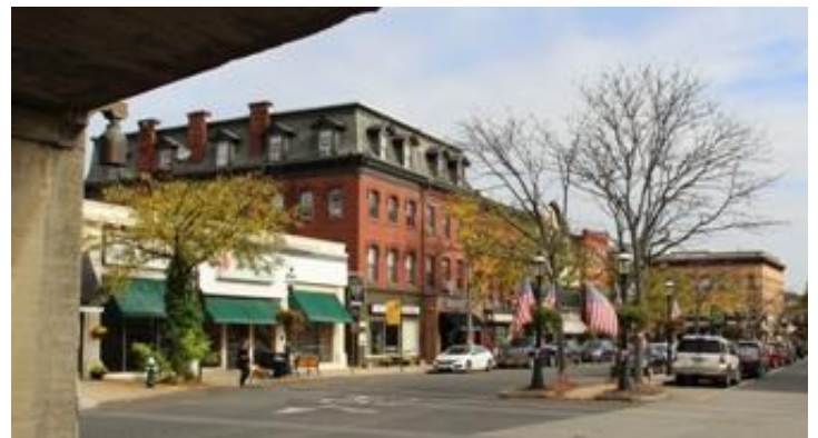
Waverly Place 2017