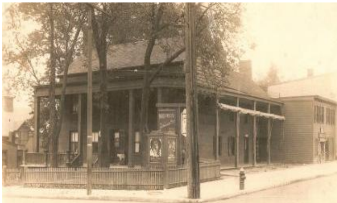
Madison House 1922, Corner of Main and Waverly.