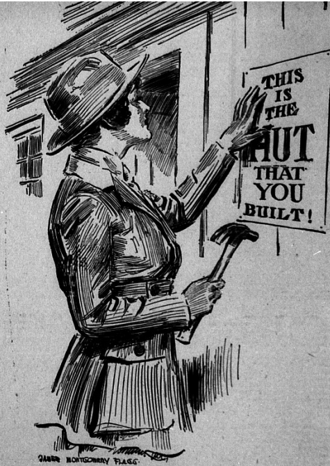
2488 MONTGOMERY FLAGG