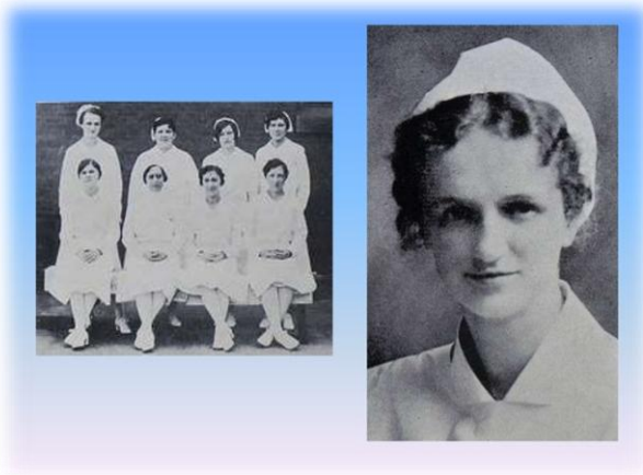
Hildegard Peplau begins her career graduating from Pottstown Hospital School of Nursing