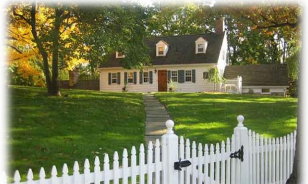
The Miller House today.